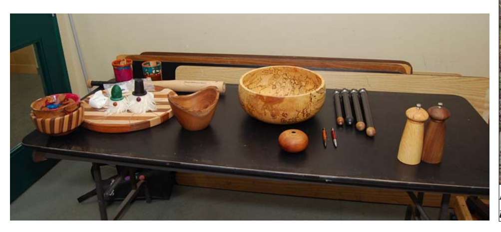
I suppose we've all had one of those days.