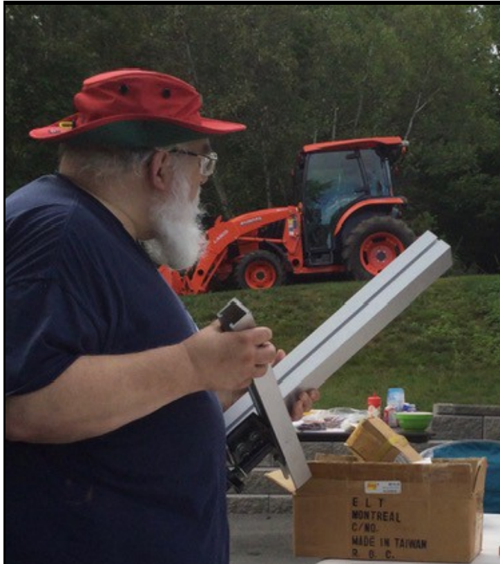
Worlds ugliest violin?