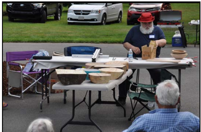
Here we go....

Seventeen souls braved the perfect weather and sunshine to attend this years cook-out. Hot dogs, burgers (perfectly cooked thank you) plus salads and salty nibbles. Wonderful!