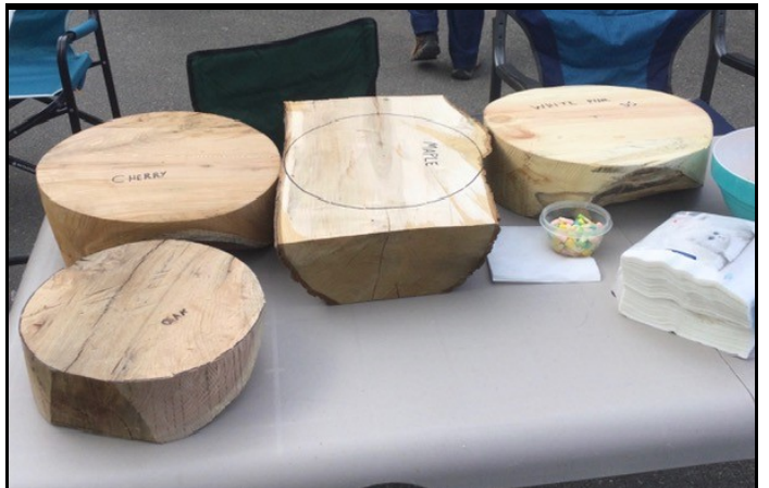
Bowl blanks up for auction.