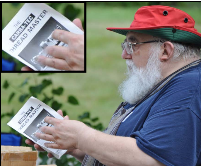
I gotta sell this thing. What is it and how does it work?