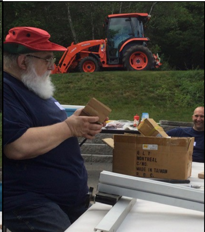
Oh! Bandsaw fence, right.