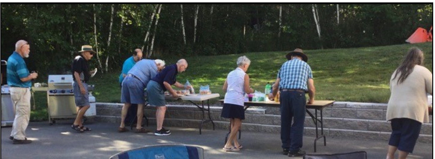
Tough stuff this bidding. Time for more good eats!