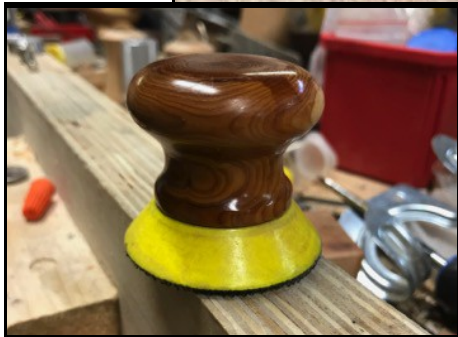
and one without. More next month.