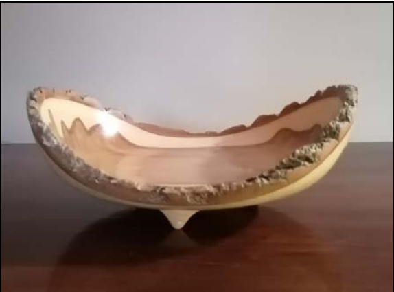
The second bowl I decided to do a live edge with carved feet.