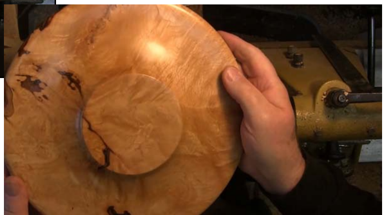
Fantastic Food Safe Finish