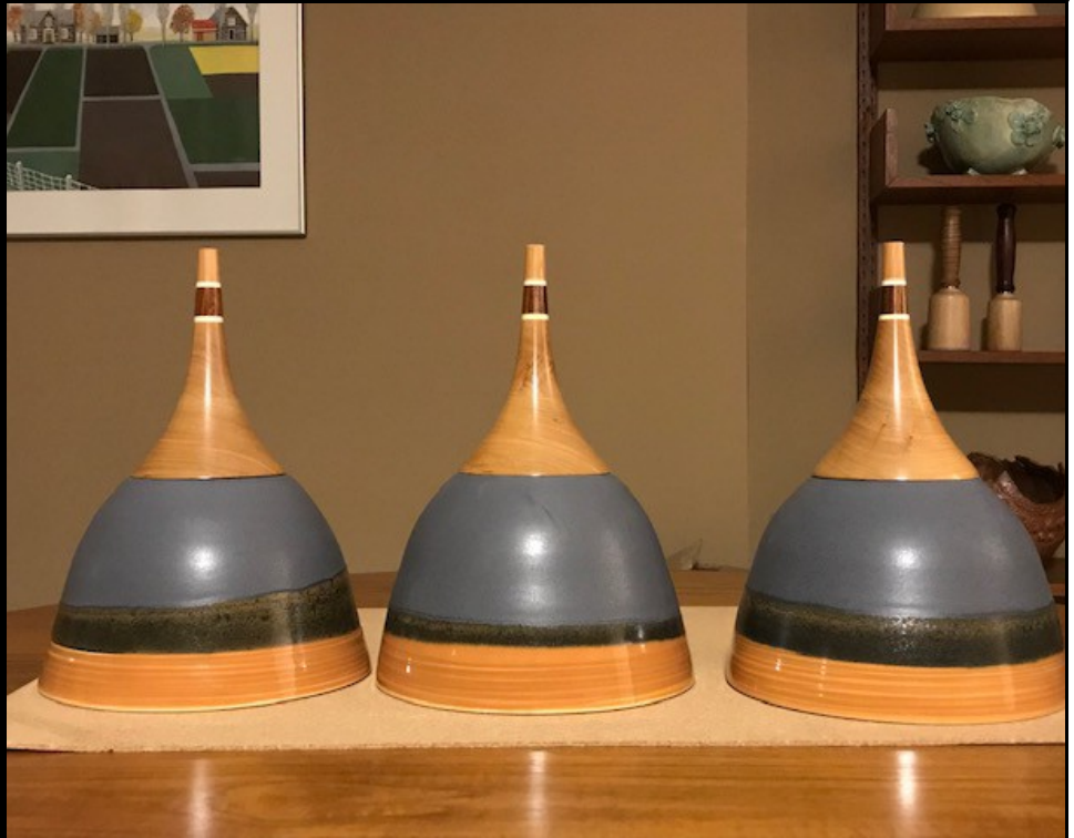
Dave McLachlan Wood and Pottery Lamp Shades