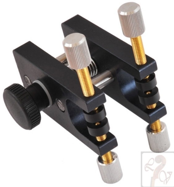
Herdim Precision Edge Clamp

Instrument makers tool but can be used to pull together an edge crack in a bowl.