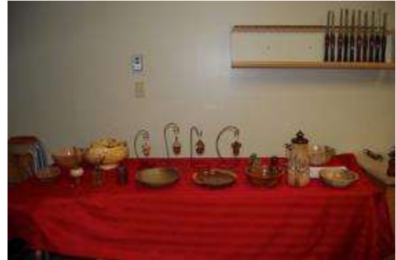
Entry items on display