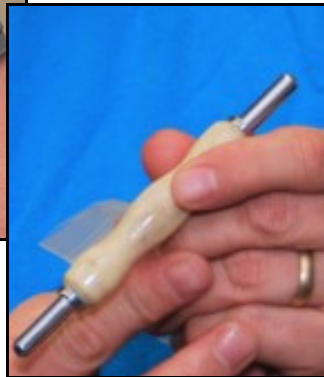
Stephen Parsons showed off a pair of pepper mills of original design based on Scandinavian influences; a ring holder in Cherry; a ring holder cup in Maple and an interesting seam ripper in deer Antler.