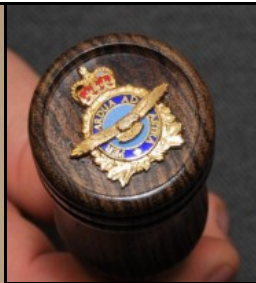
Yogi Gutz showed of a very nice bottle stopper in Bocote with an inset Airforce pin.