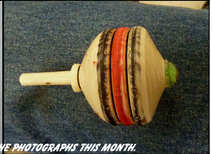
The finished and embellished top, ready to roll.