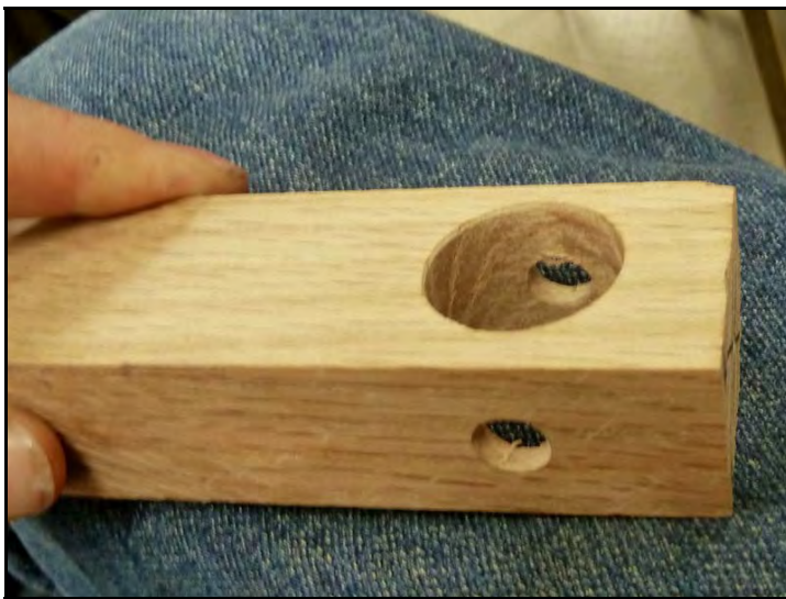
Cross drilled handle blank ready for turning.

Next month's meeting will be our annual Christmas social at Halifax Specialty Hardwoods 112 Bluewater Rd, Bedford NS. Halifax Specialty has been good enough to host the event the last number of years and always seems to come up with some special pricing for that night. It will be as usual pot luck, special draws and this year an ornament exchange. Please turn your style of ornament, wrap it and place it in the box. Then you will be able to choose another ornament from the box. If you would like to do 2 or 3 that would be great. As usual seating is very limited so please bring a chair for yourself and the friends you bring.