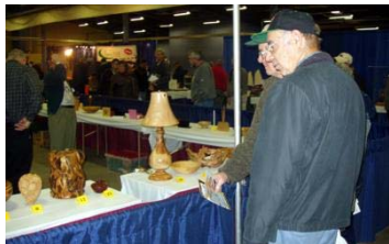
Visitors at our display