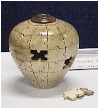
Denton Ford's Turning