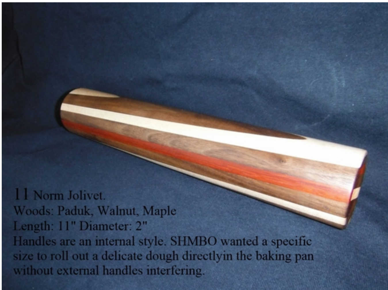
11 Norm Jolivet. Woods: Paduk, Walnut, Maple Length: 11" Diameter: 2" Handles are an internal style. SHMBO wanted a specific size to roll out a delicate dough directly in the baking pan without external handles interfering.