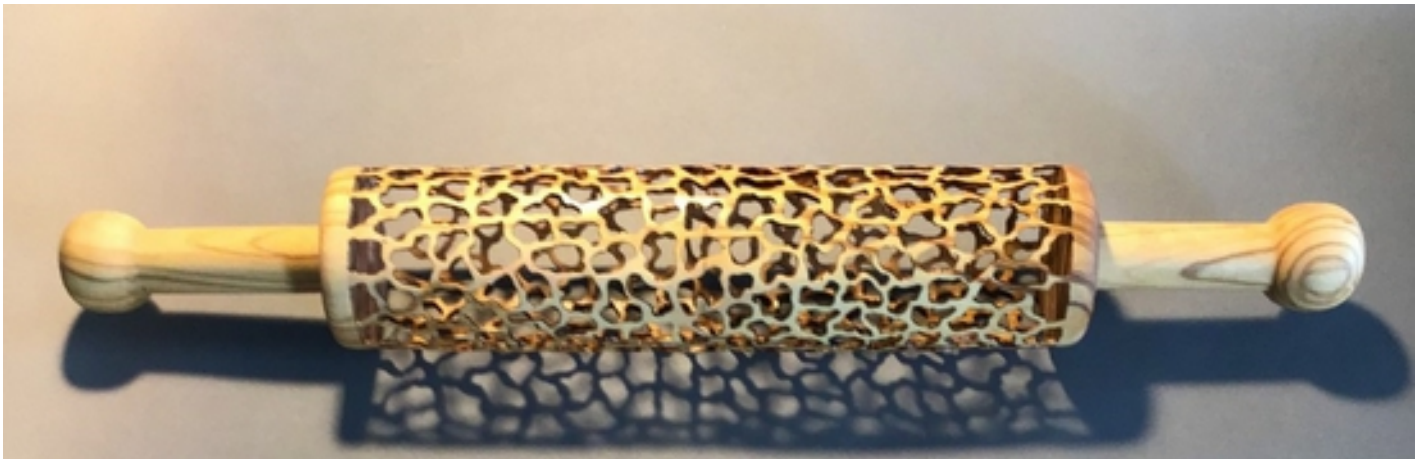
02 Zalman Amit A Decorated Rolling Pin Wood: Olive Length: 18.5" Diameter: 2.5"