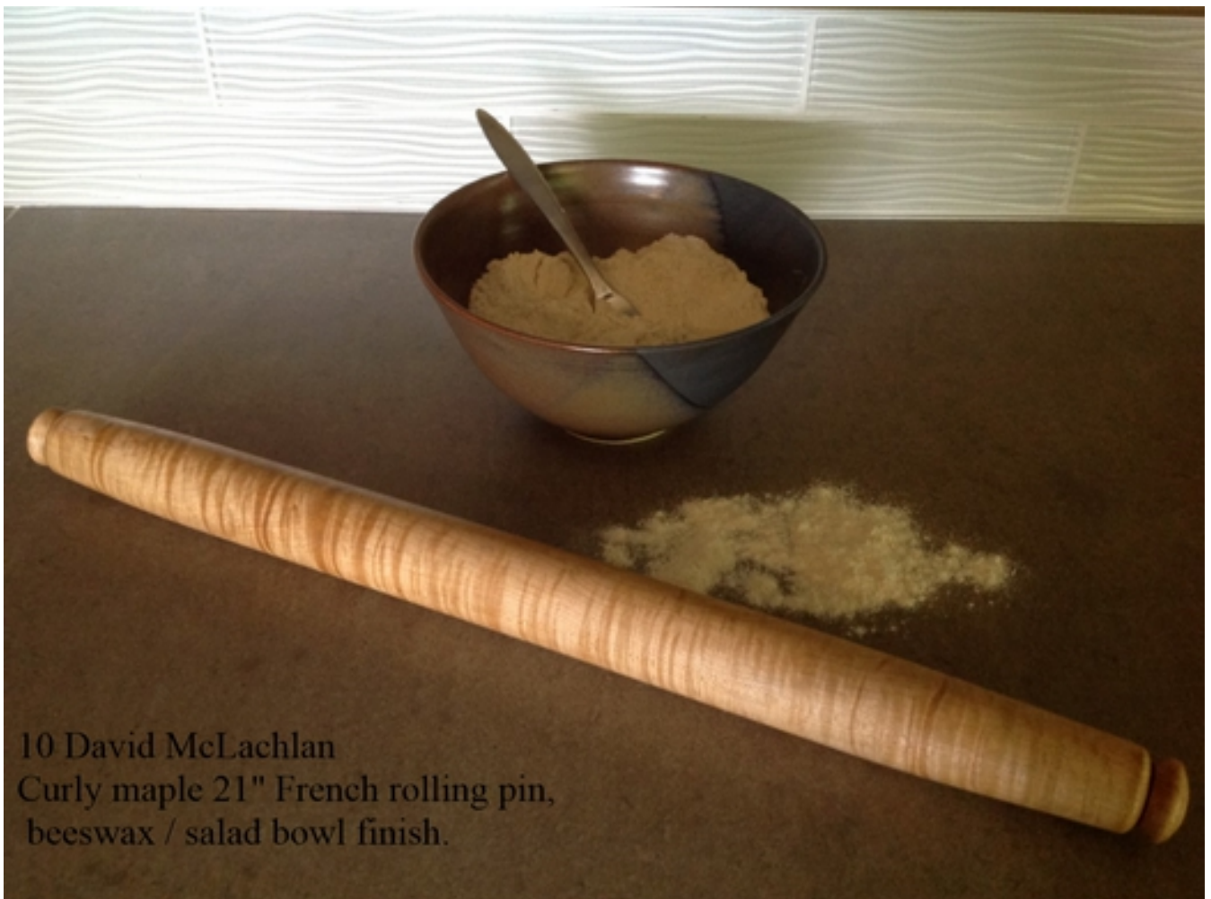
10 David McLachlan Curly maple 21" French rolling pin, beeswax / salad bowl finish.