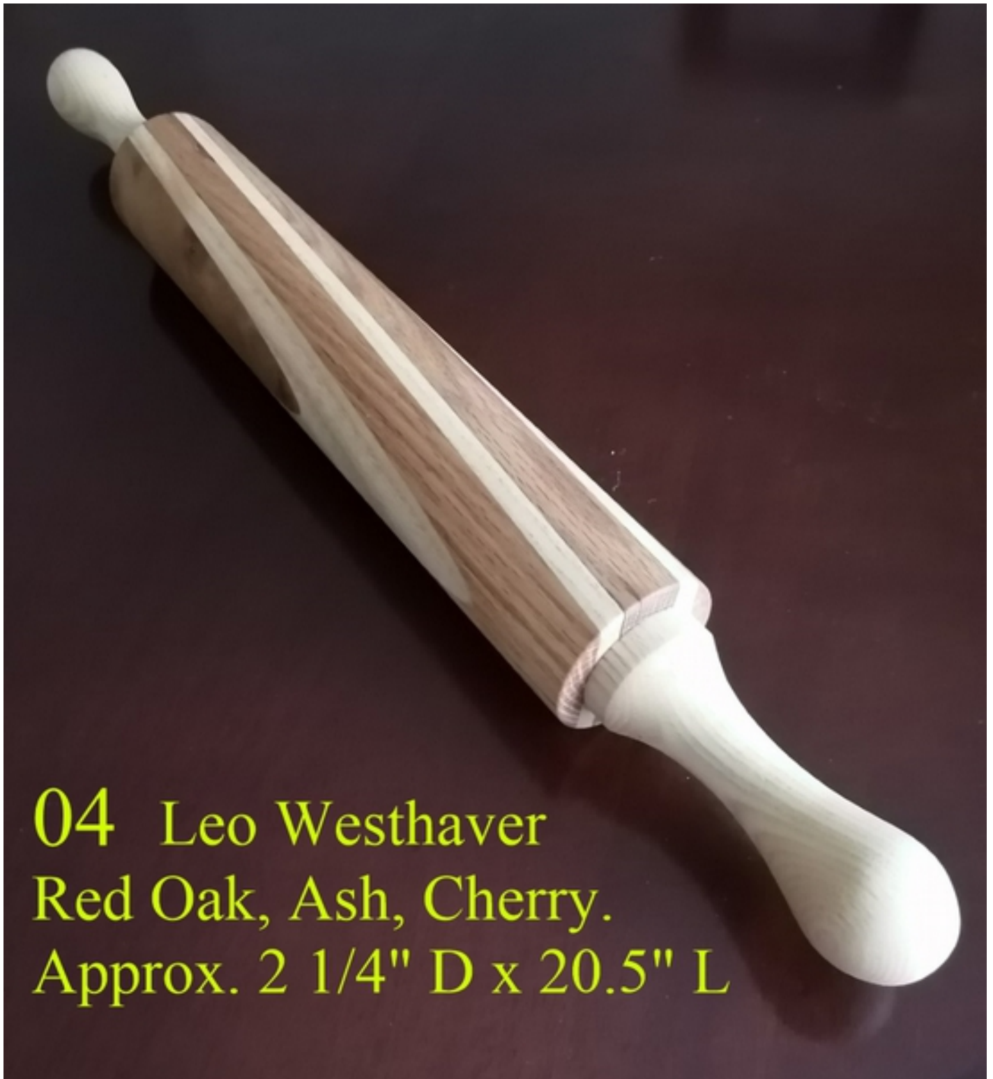
04 Leo Westhaver Red Oak, Ash, Cherry. Approx. 2 1/4" D x 20.5" L