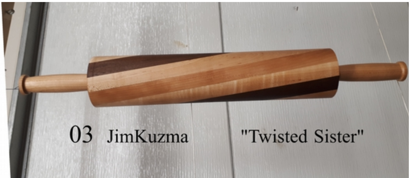
03 JimKuzma "Twisted Sister"