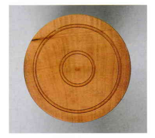
The beads on the underside could be replaced by grooves; the drawing shows one of each

● Form the beads with a ½in (2mm) fluted parting tool. This will give a perfect bead time and time again ● To save a lot of time removing the waste, pre-bore the box with a Forstner bit in a Jacobs chuck which is held in the tailstock