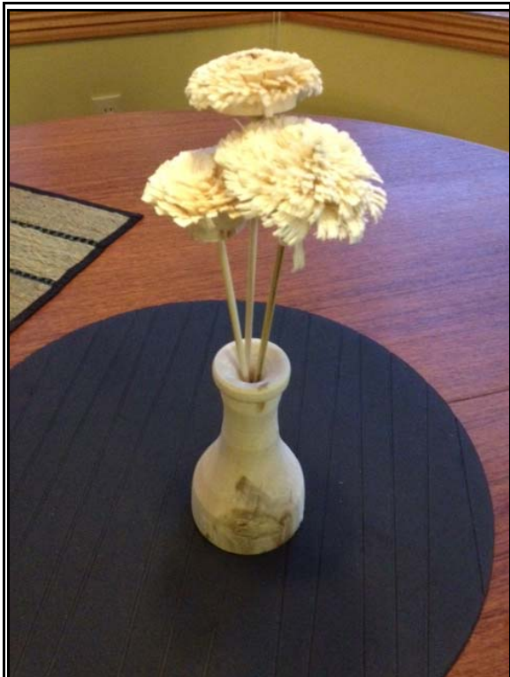
Flowers - Gil Pacheco

Gary Landry got us some great looking flash badges for those staffing the booth to wear.