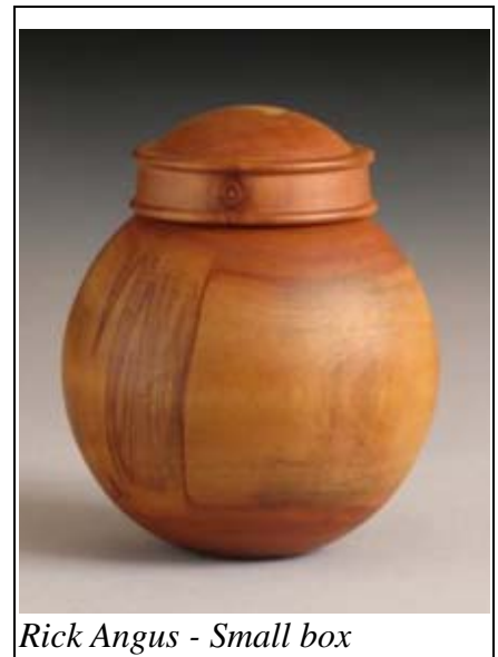
Rick Angus - Small box

one of them). This tenon is the same width as the amount cut out when separating the top and bottom and so exactly fills the gap. Given that it's from a contrasting wood, the eye fills in the gap and so the grain in the main box looks continuous. A lovely trick and one I am definitely going to try.