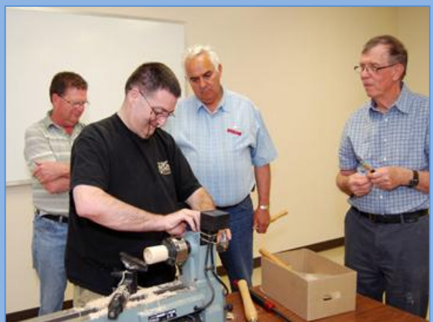
Yep, Repair Work...