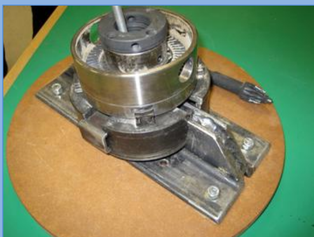
Show & Tell – Off Center Jig