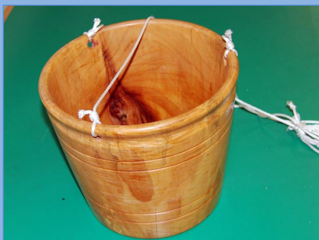
Show & Tell – Hanging Plant Holder