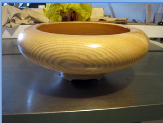
Show & Tell – Ash Bowl