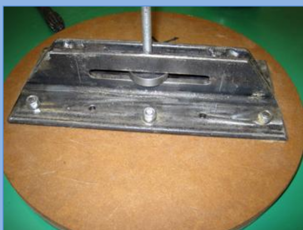
Show & Tell – Another View Of Jig