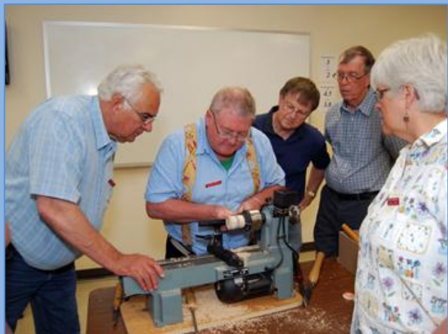
Members Trying Texturing Techniques