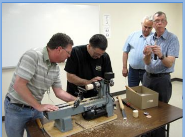
Lathe Repair Work?