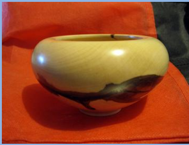
Show & Tell – Coffee Bean Infused Bowl