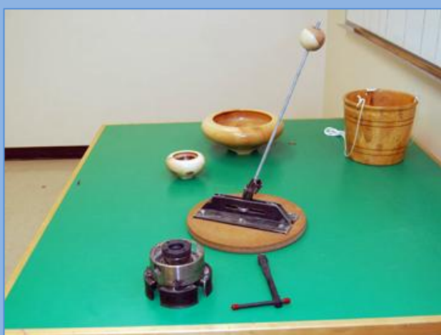
Show & Tell Pieces